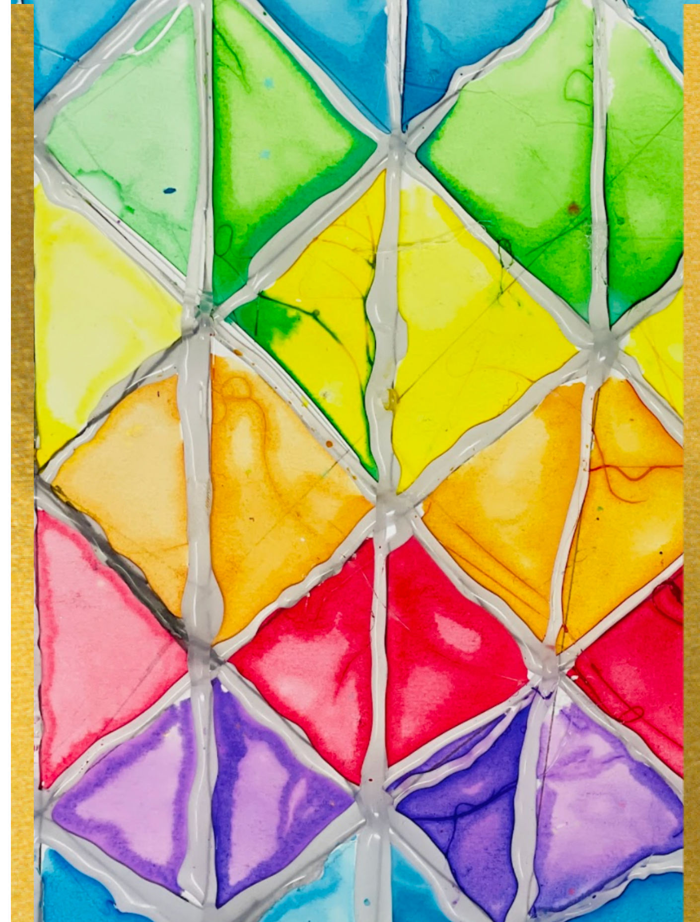
Connor Cavanaugh, Grade 6