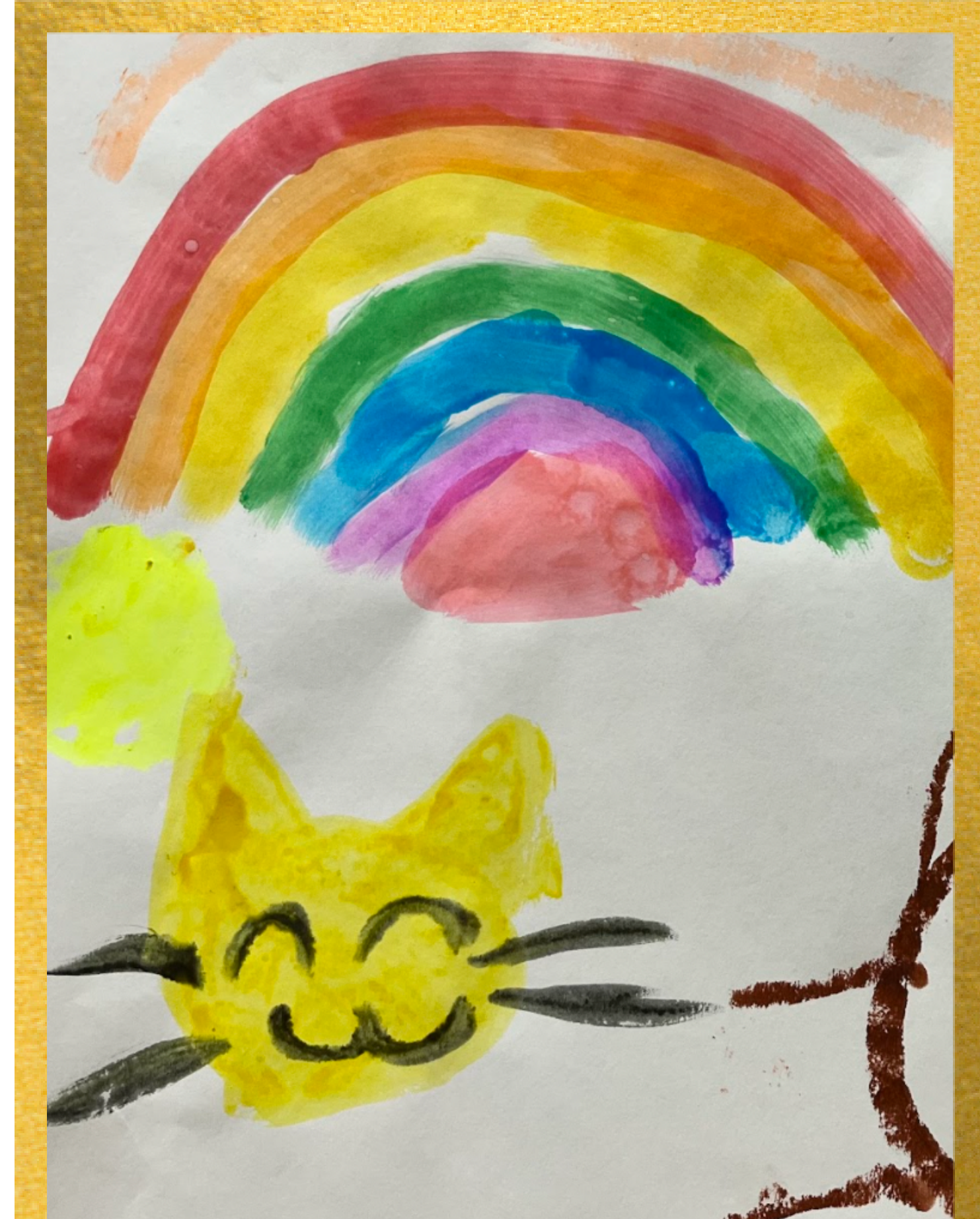
Zoey Chen, Grade 2