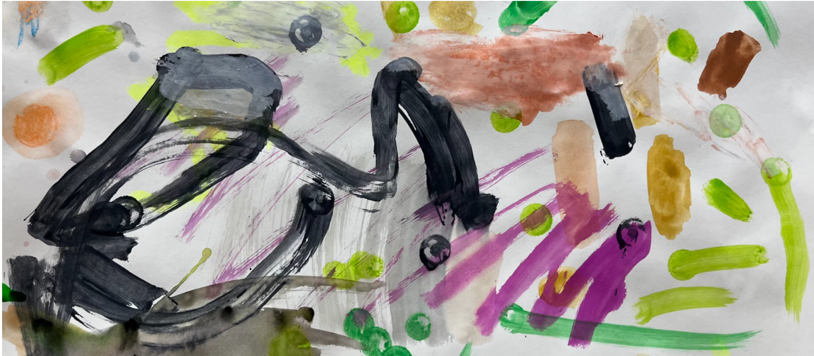
Nolan Lyu, Grade 1